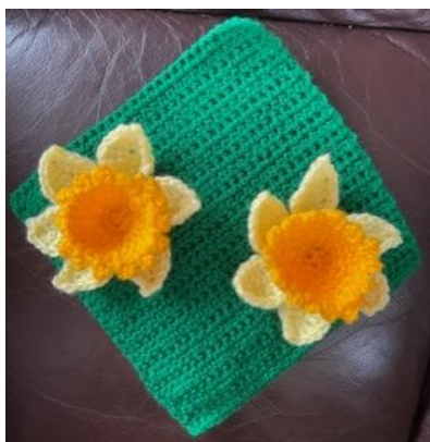
Crochet Daffodils by Gill Kitchener